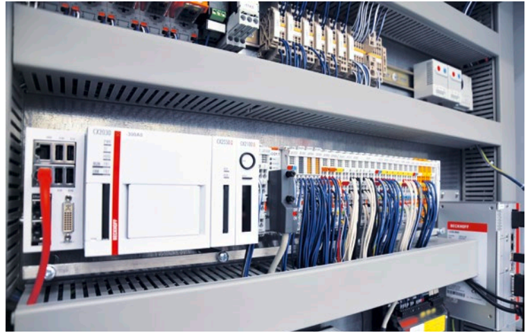
The Beckhoff CX2030 Embedded PC (left) in the tower control cabinet controls the entire system, while the C6930 control cabinet IPC (right) handles visualization, monitoring and remote access in the prototype installation.

including the option to use fiber optic cabling. Integrating the systems is also easy, because all safety data is available in the controller automatically and without any additional hardware.”