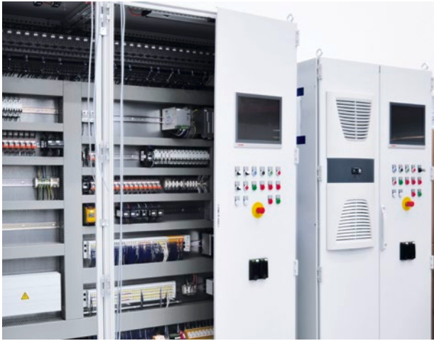
Both the tower control cabinet (right) and the nacelle control cabinet (left) of the turbine prototype use a CP2915 multi-touch Control Panel with a 15-inch screen for easy operation.