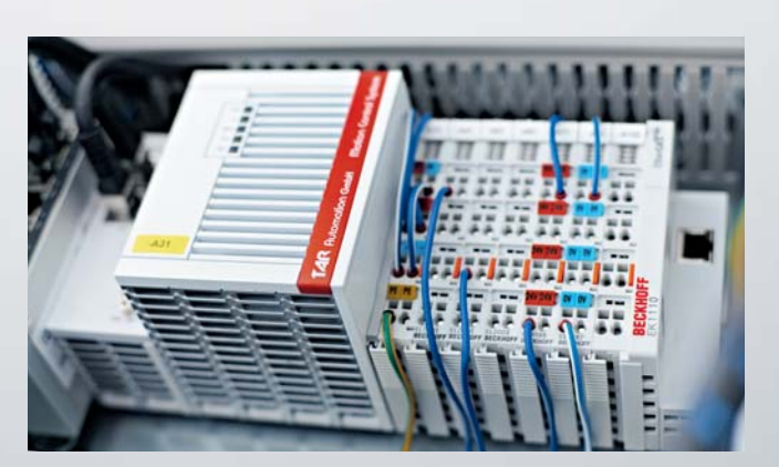
The condition monitoring system is supplied ready for operation, installed in a compact terminal box.

The vibration sensors used by TAR Automation are based on ICP<sup>®</sup> technology and have the significant advantage that the measuring signal is transferred as a voltage value with low source impedance, which is immune to interference. This minimizes disturbances through electrical and magnetic fields from adjacent devices. The different versions and types of available sensors facilitate use in virtually any situation, including high-temperature applications or Ex zones.